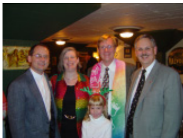
Archive photo from Reconciling celebration

I am so excited, together with your brothers and sisters in the Capital Area North District, on this your 5th anniversary of becoming a Reconciling Church. The love of God and the passion of Jesus Christ shows very much through all of you and especially in this ministry.