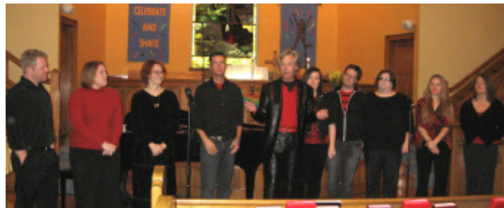
The Centerstage Players joined us in celebration singing "I'm Going Home"